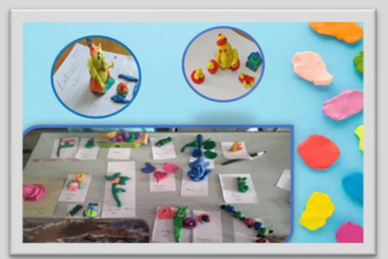
~ Harini, Class VII

We celebrated Ganesh Chaturthi with great devotion and festivity on the 15<sup>th</sup> September. The festival begun with ceremonial lighting of traditional lamp followed by special puja.