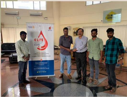
Blood donation drive at our school campus.