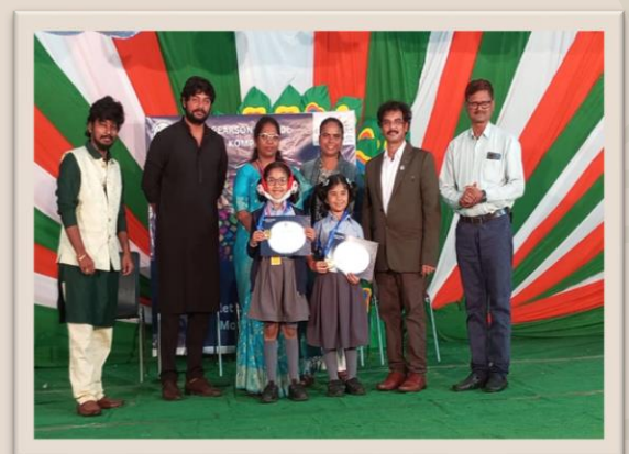
Our students participated in KSHAMA - Inter School Competition and brought accolades to the school.